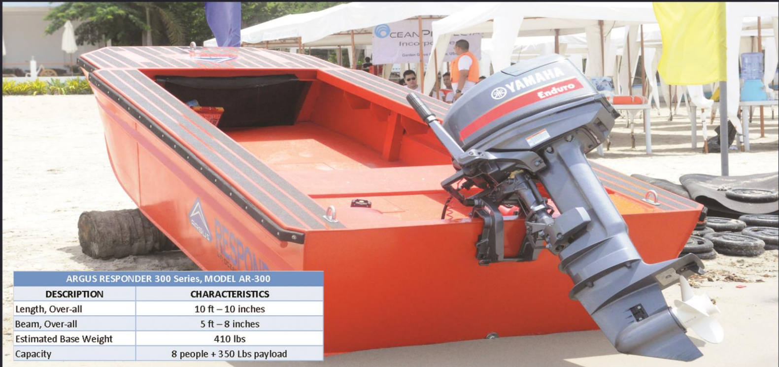
ARGUS RESPONDER 300 Series, MODEL AR-300